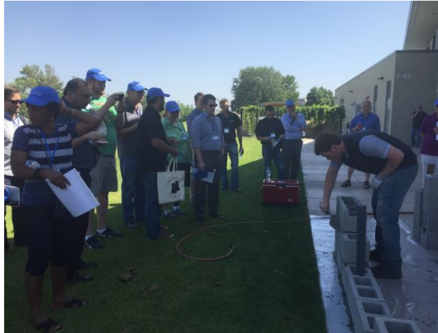
Masonry demonstration by the Northwest Concrete Masonry Association

Last month I attended the SEA Northwest Conference in Richland, WA, as Seattle's Young Member Delegate. It was a great opportunity to learn and to expand not only my connections but those of our Seattle YMG.