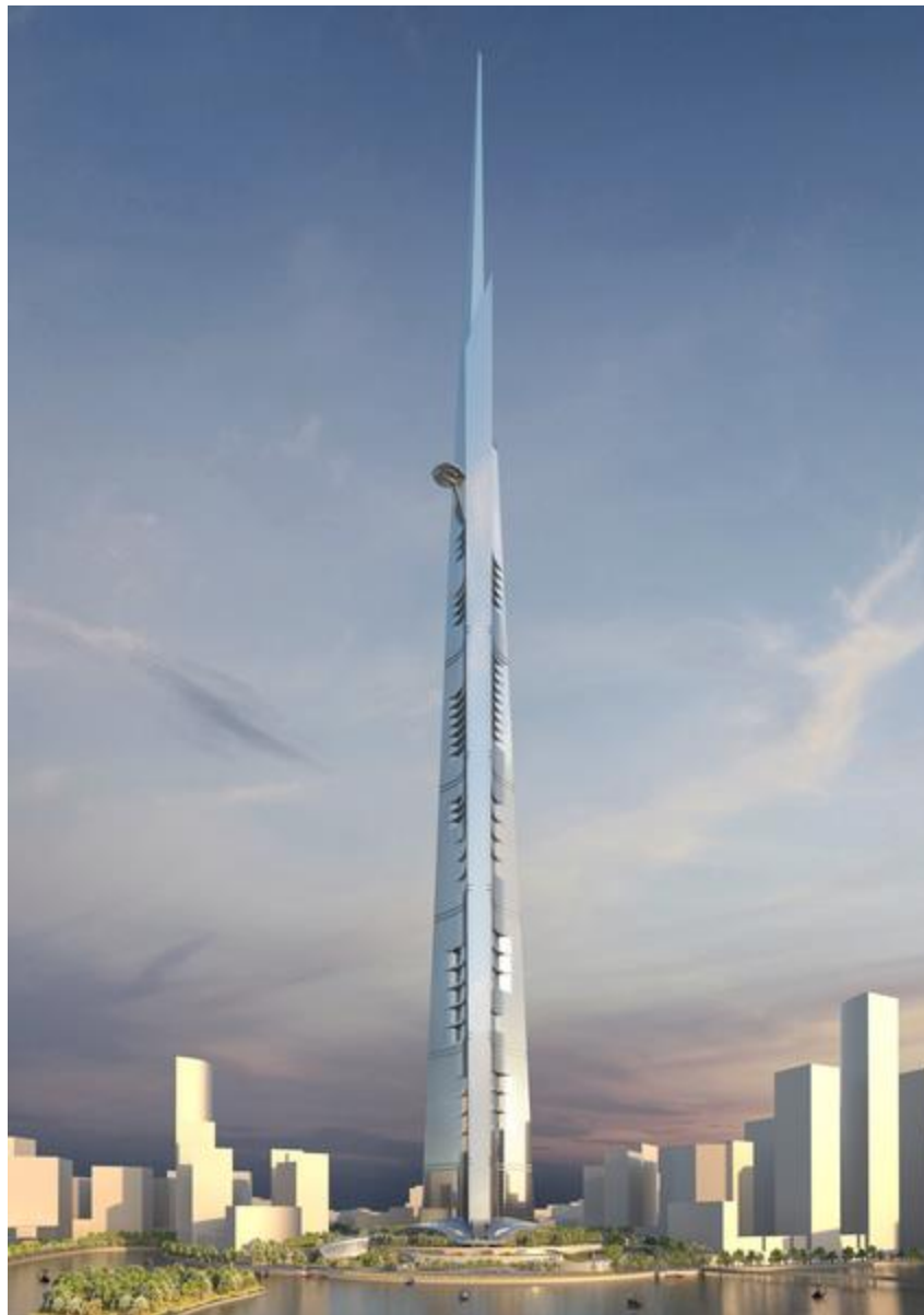
Jeddah Tower, a skyscraper expected to reach more than a kilometer tall, currently under construction in Saudi Arabia