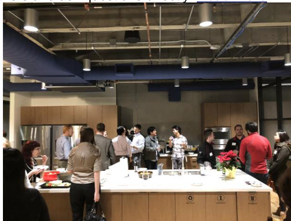
“YMG November Happy Hour at Coffman Engineers.”