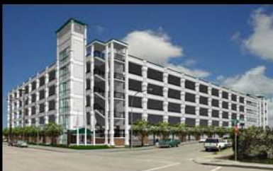
U.S. Navy PSNS Parking Garage