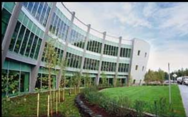
University of Alaska Anchorage Library