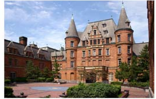
Tacoma's Historic Stadium High School

Stadium High School Castle Building was made safer and more functional while still retaining the historic character of the building. In many ways, the historic character of the building was enhanced by adding or exposing features that were removed or covered up at some point in the building history, but uncovered during construction. The renovation was completed in time to for the school to celebrate its