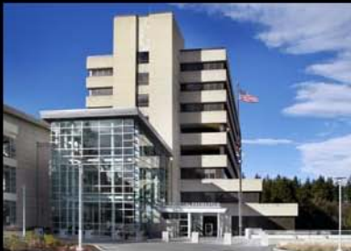
Naval Hospital Bremerton Seismic Upgrades