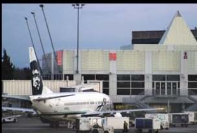
SeaTac Airport Seismic Improvements Program