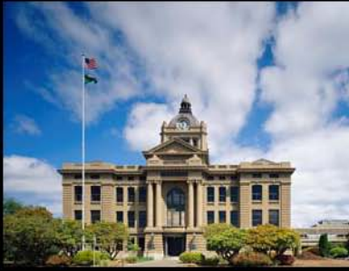
Grays Harbor County Courthouse Renovation