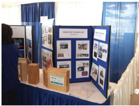
Computer technology display and engineered wood samples

As part of national Engineers Week, the Puget Sound Engineering Council hosts an annual Engineers Fair. This year's fair was held on Saturday, February 16 th at the Museum of Flight and was attended by about twenty local engineering societies and colleges. The Engineers Fair is also the site of the Popsicle Stick Bridge competition hosted by the American Society of Civil Engineers, a hands-on activity where West-